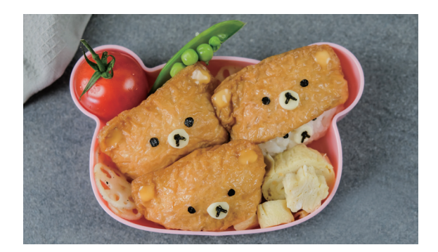
*Bento is a Japanese word.

A "bento"* box is a compartmentalized container for carrying a home prepared meal (usually lunch) for a single person, making it a very effective tool for meal planning. Choose a bento box that has 4-5 compartments. Fill the largest compartments with vegetables. Put whole grains, protein, fruits and dairy into other compartments. That way, you know your meal is balanced and includes all food groups.